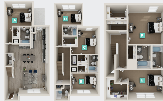
FORTSON 6 BED / 6.5 BATH COTTAGE