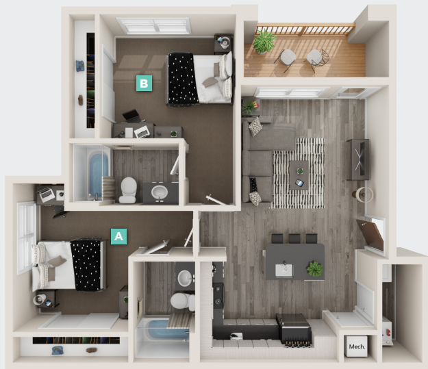
B1 & B1 ALT 2 BED / 2 BATH APARTMENT