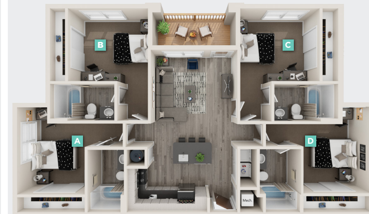
D1 4 BED / 4 BATH APARTMENT