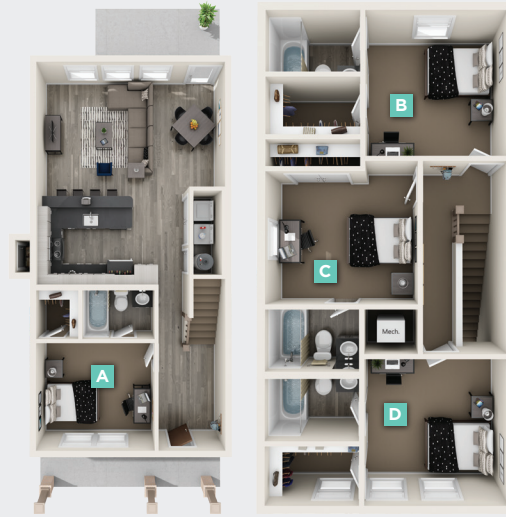
LUMPKIN A 4 BED / 4 BATH COTTAGE

The Retreat offers a truly incredible variety of sizes and layouts to choose from with bedrooms numbering between one and six.