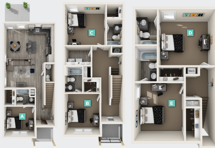
TALMADGE 5 BED / 5.5 BATH COTTAGE