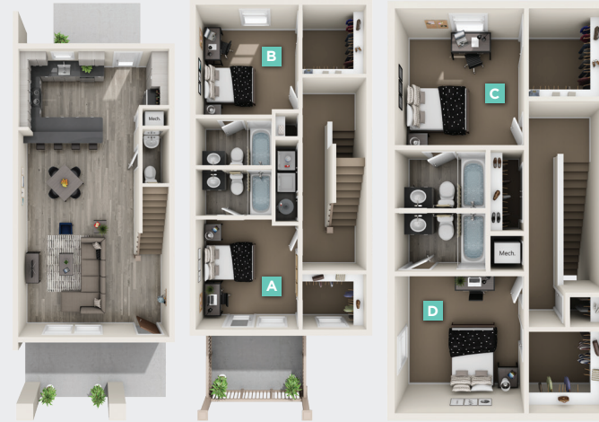
LUMPKIN B 4 BED / 4.5 BATH COTTAGE