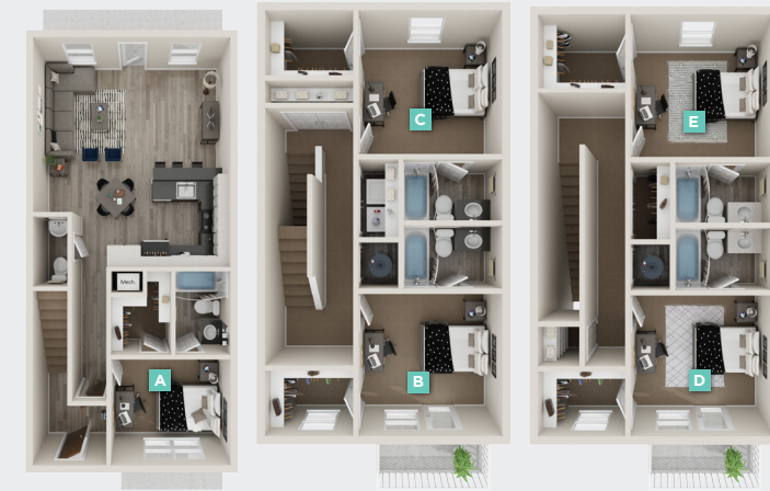
BALDWIN 5 BED / 5.5 BATH COTTAGE